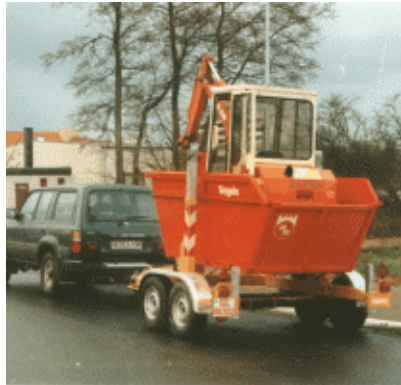
BKT 23 with Container and mini-excavator