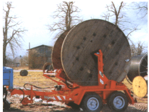
BKT 60 with cable drum drive

Irrespective of ground conditions the trailer can be loaded by one man in a couple of minutes. The trailer shifts the cable drum into pick up position by finger-tip control and hauls it to trailing position between the axles.