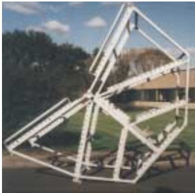
uncoiling cage with quick change system for the rollers