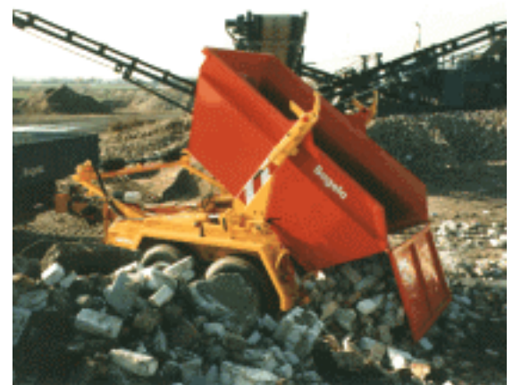
BKT 60 while unloading bulk material

Besides being a modern cable transporting and laying trailer of the latest engineering standard, this multipurpose concept will help solve your on-site problems in respect of material supplies and waste disposal.