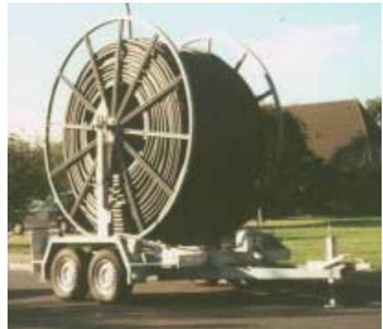
BKT 23/27 with HDPE-tubing drum

Unhooked from the towing vehicle, the empty trailer can be easily manoeuvred by hand, owing to its weight being concentrated on the rear side.