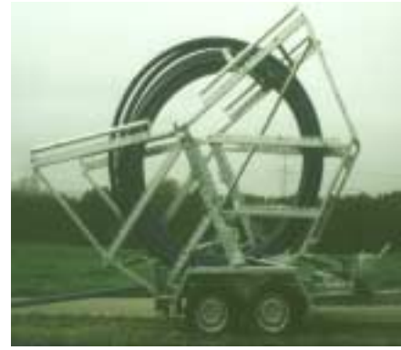
BKT 23 with uncoiling cage